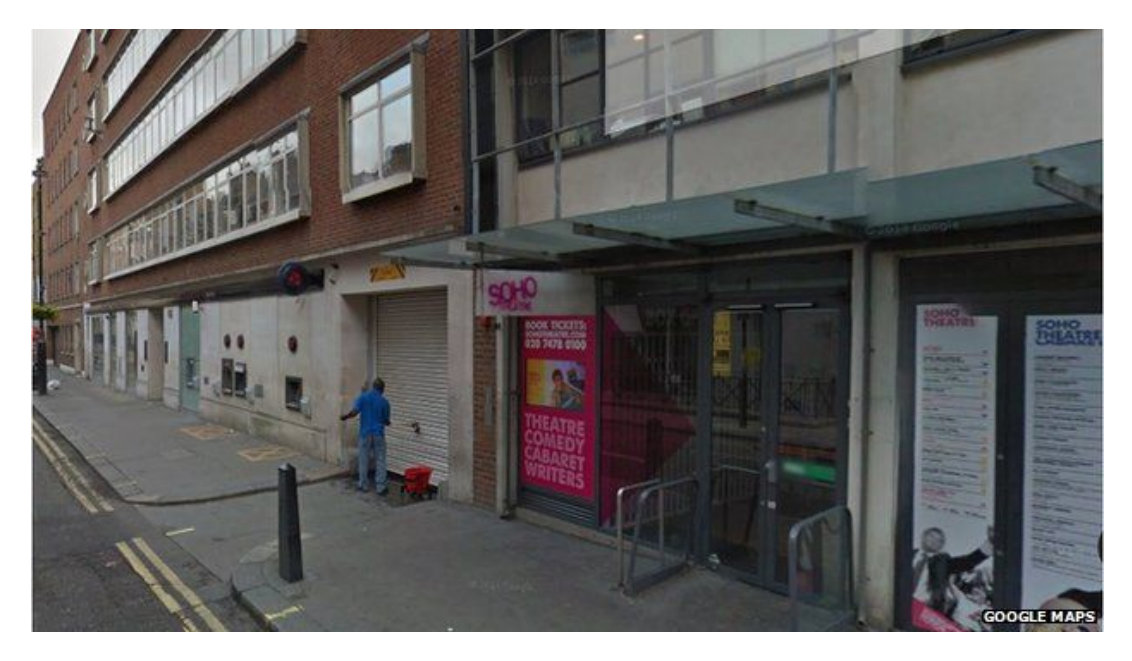
The theatre said it had "co-operated fully with the investigation"

"One only has to read her two victim impact statements to see the way in which, and the extent to which, her life has been turned upside down.